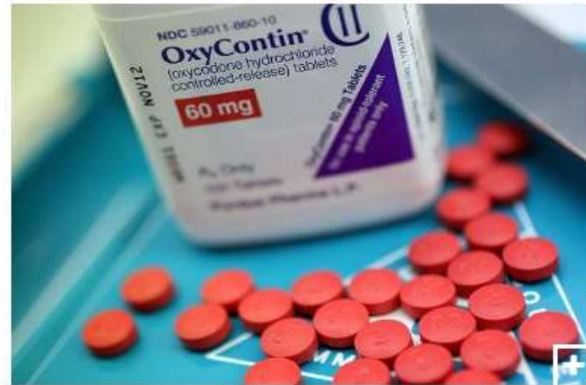
REQUEST TO BUY THIS PHOTO

The Buckeye State also recorded the most deaths from synthetic opioids: About 1 in 14 U.S. deaths.